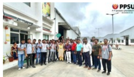
DOMS Industries Pvt Ltd., Umargam