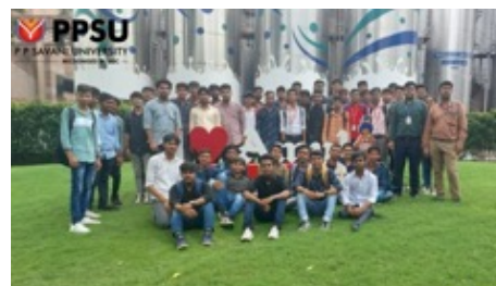
Amul Dairy, Anand and Amul Chocolate Plant, Mogar