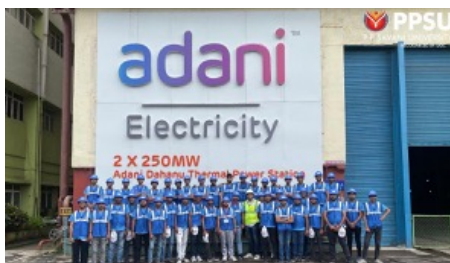
Adani Dahanu Thermal Power Station