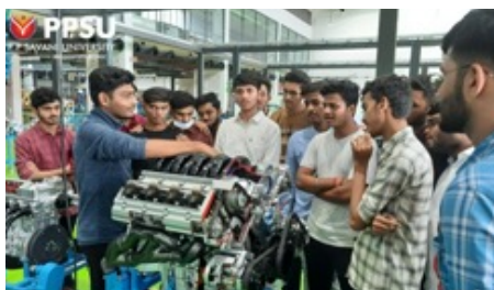
International Automobile Centre of Excellence - iACE, Gandhinagar.